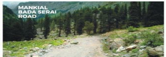
MANKIAL BADA SERAI ROAD