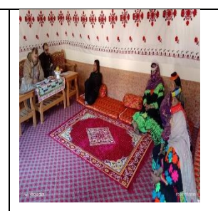
FGDs with Bamburet Women