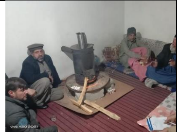
Collection Information from local community