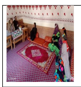
FGDs with Bamburet Women