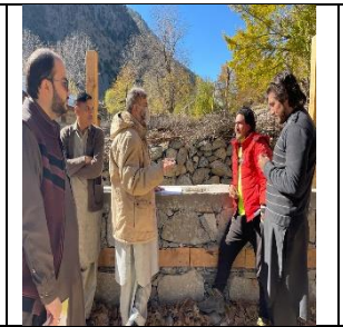
Collection Information from local community