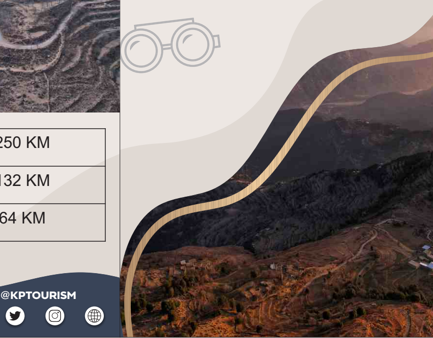
Explore the Unexplored Heaven of Pakistan